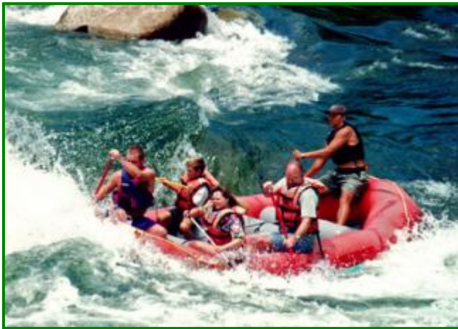
Rafting the Main Payette River